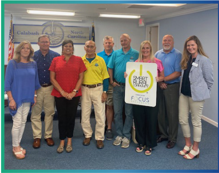
Calabash SRC Presentation

The Town of Calabash has been named as the newest recipient of the Smart Rural Community designation, presented by FOCUS Broadband. The Smart Rural Community designation highlights projects which make rural communities vibrant places to live and do business through the implementation of innovative broadband-enabled solutions.